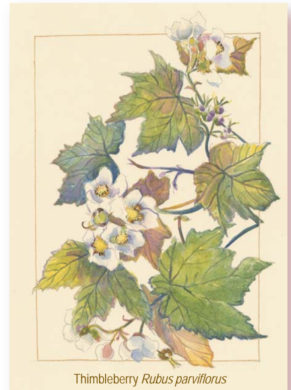
Thimbleberry Rubus parviflorus

The Northwest Native Plant Garden is an ongoing project of The Tacoma Garden Club. Started in 1963 the garden displays a wide variety of Northwest native plants. It is maintained by the Tacoma Garden Club in cooperation with Metro Parks Tacoma.